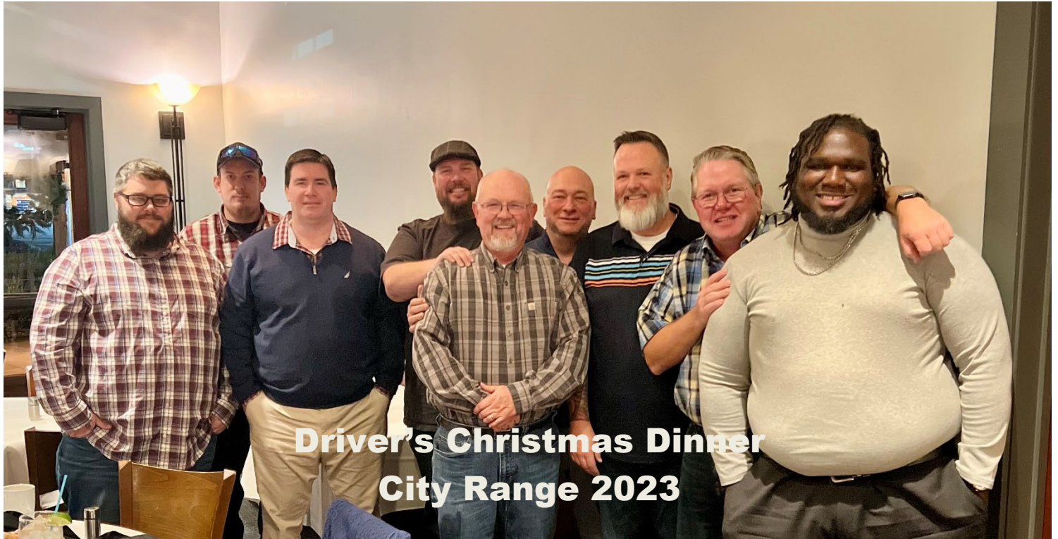
Driver's Christmas Dinner City Range 2023